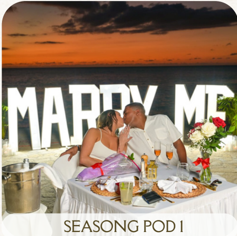
SEASONG POD 1