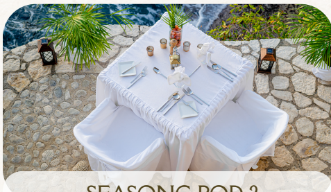
SEASONG POD 2