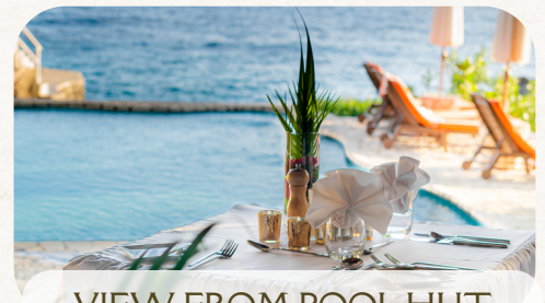
VIEW FROM POOL HUT